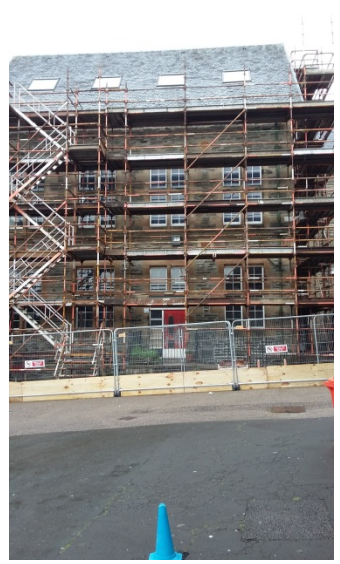
Scaffolding being erected to West Wing (rear elevation)

The images below illustrate the progress made to date: