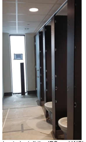
Work ongoing to install the IPS and WC's in the pupil toilets