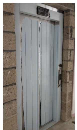
Lift installation awaiting commisioning