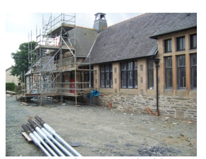
External works to 1881 building nearing completion. Groundworks to commence