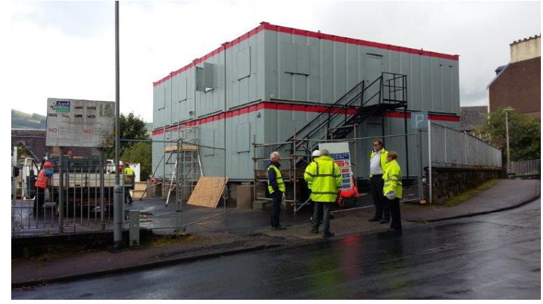
Site offices being installed in car park off Kirk Street