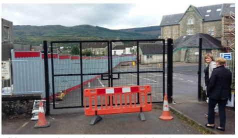
New pedestrian and vehicular access gates on Kirn Street