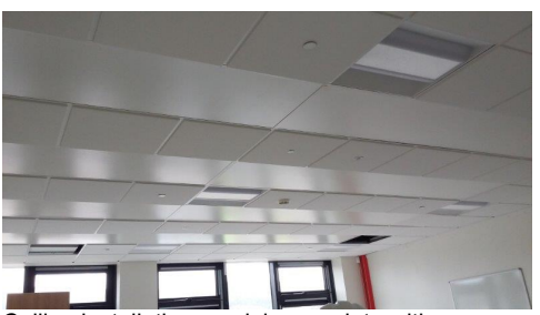
Ceiling installations mainly complete with integrated radiant panels