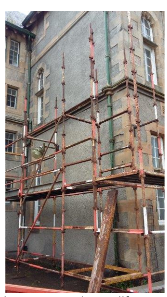
Scaffolding being erected on Hillfoot St elevation of West Wing