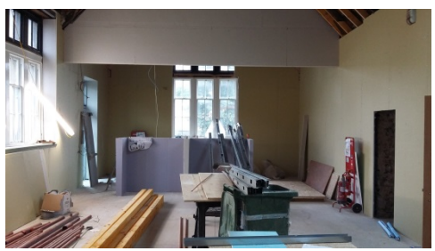
Internal works ongoing in 1881 building