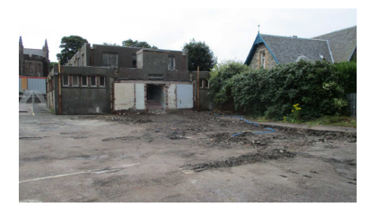
Bike shed prior to and post demolition