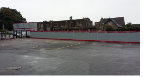
Site hoarding to main playground area