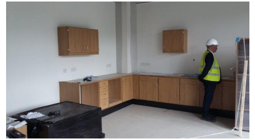
Staffroom awaiting white goods to be installed