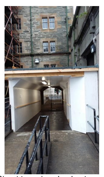
Protected pedestrian access from Hillfoot Street to main school entrance