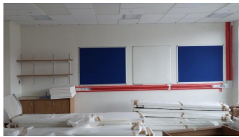
Typical rear wall of a classroom