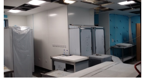
School kitchen installation nearing completion