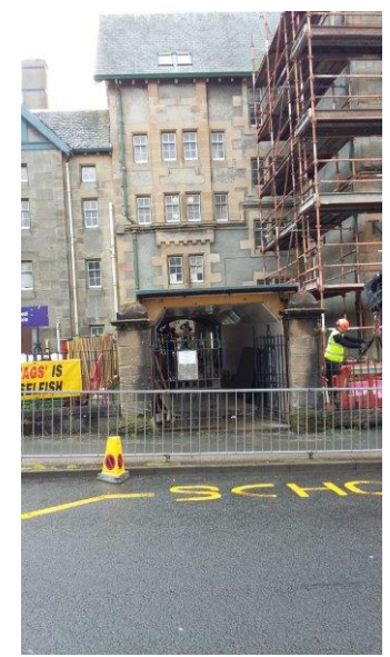
Scaffolding to West elevation at the existing pend entrance to the school from Hillfoot Street