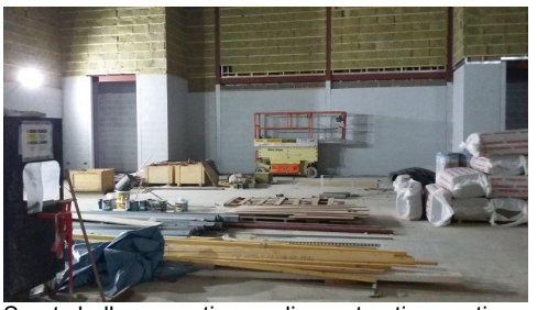
Sports hall – acoustic paneling, retractive seating and flooring to be installed