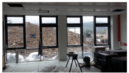
Window installations in classrooms